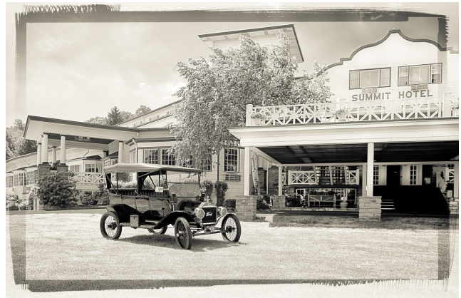
Summit Inn, June 2013